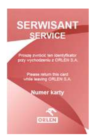
"SERVICE TECHNICIAN" card