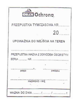
Temporary paper card