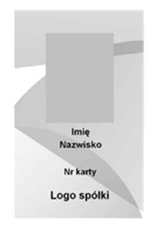
f Card for staff members of the Company