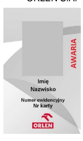
An identification card for staff members of ORLEN S.A.