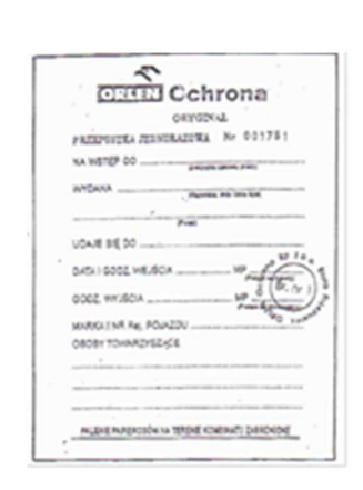
One-off paper card