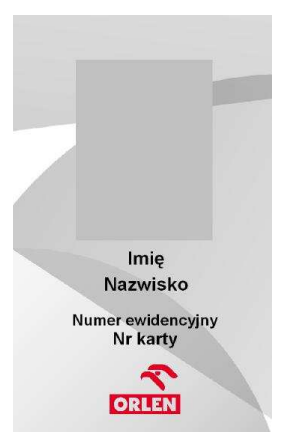
An identification card for staff members of ORLEN S.A.